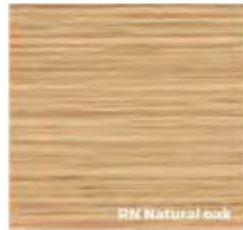
RN Natural oak