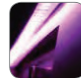
Lemi color therapy