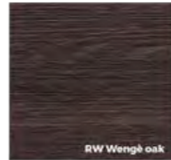
RW Wengé oak