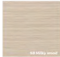
SB Milky wood